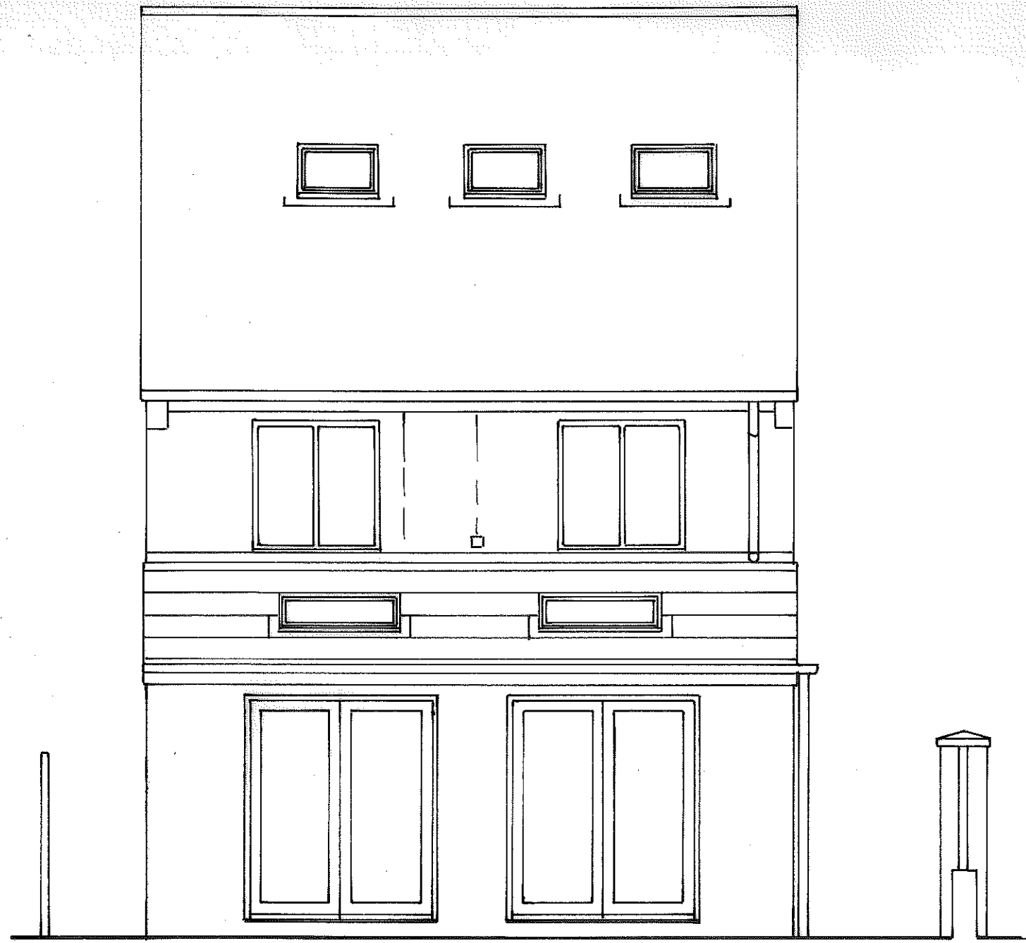
PROPOSED REAR 1:50